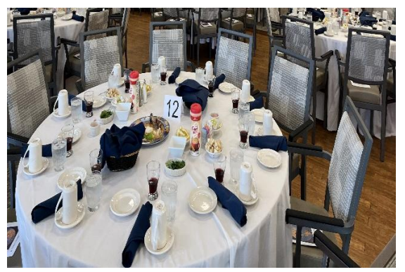
BEFORE THE SEDER