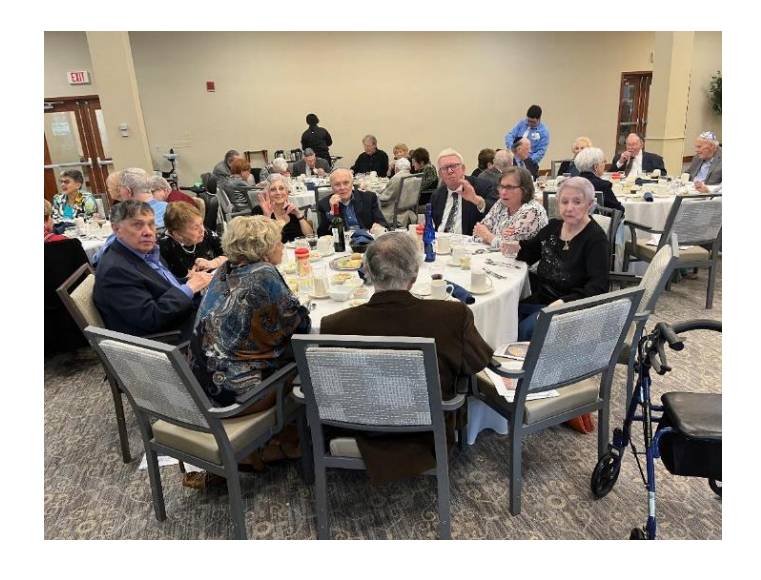
SOME OF THE MANY PEOPLE WHO ATTENDED AND ENJOYED THE SEDER