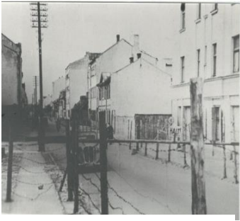
Riga Ghetto, Latvia