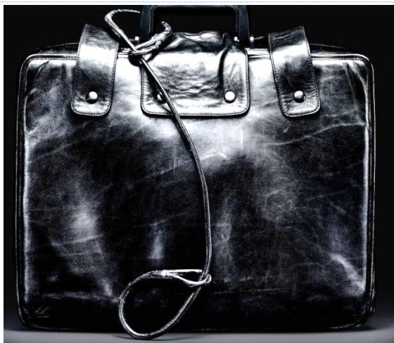
From the Smithsonian National Museum of American History, the nuclear “Football.”

Contrary to popular belief, the Football does not