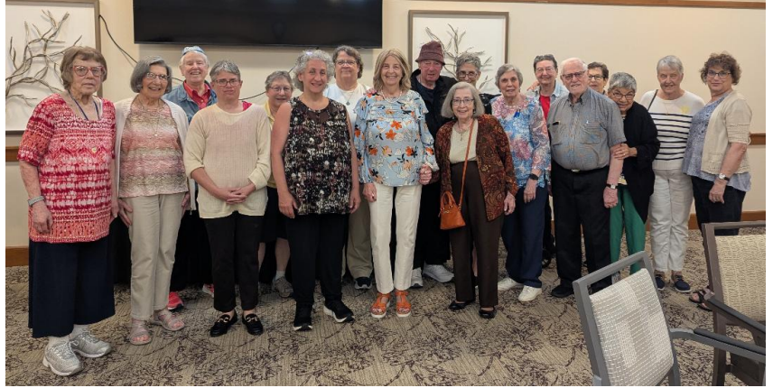
A few of the many people who attended